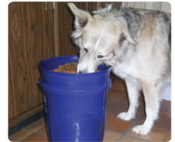
Perfect for pet foods, too!