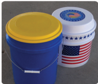
Lids fit a variety of pail sizes.

Our 6 gallon pail doubles as a convenient insulated cooler when paired with the Top Hat lid. A 4-gallon covered styrofoam insert fits snugly inside to keep contents hot or cold for backyard parties, tailgaters, sporting events, camping and year-round outdoor activities. The lid keeps things covered easily when not in use, and like the pail can be custom tinted to the color of your choice and printed with your logo.