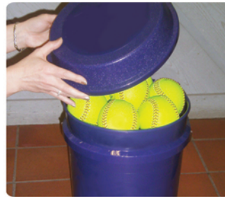
Keeps sporting goods organized.