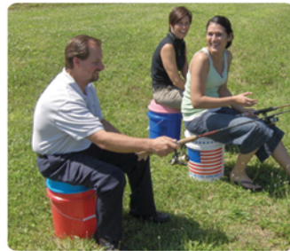
Great for outdoor activities.